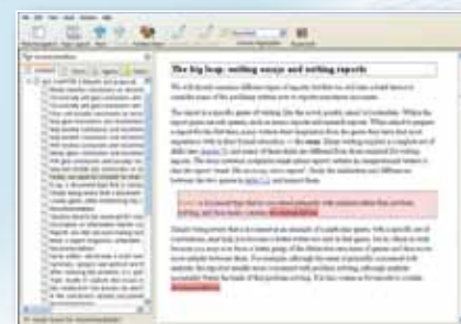
Use the search function to locate key concepts.